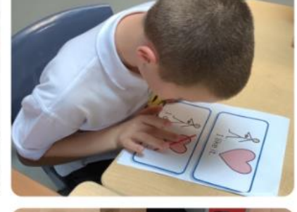
Mango Monday and Wake and Shake